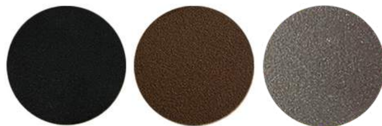
Black, Copper, Bronze